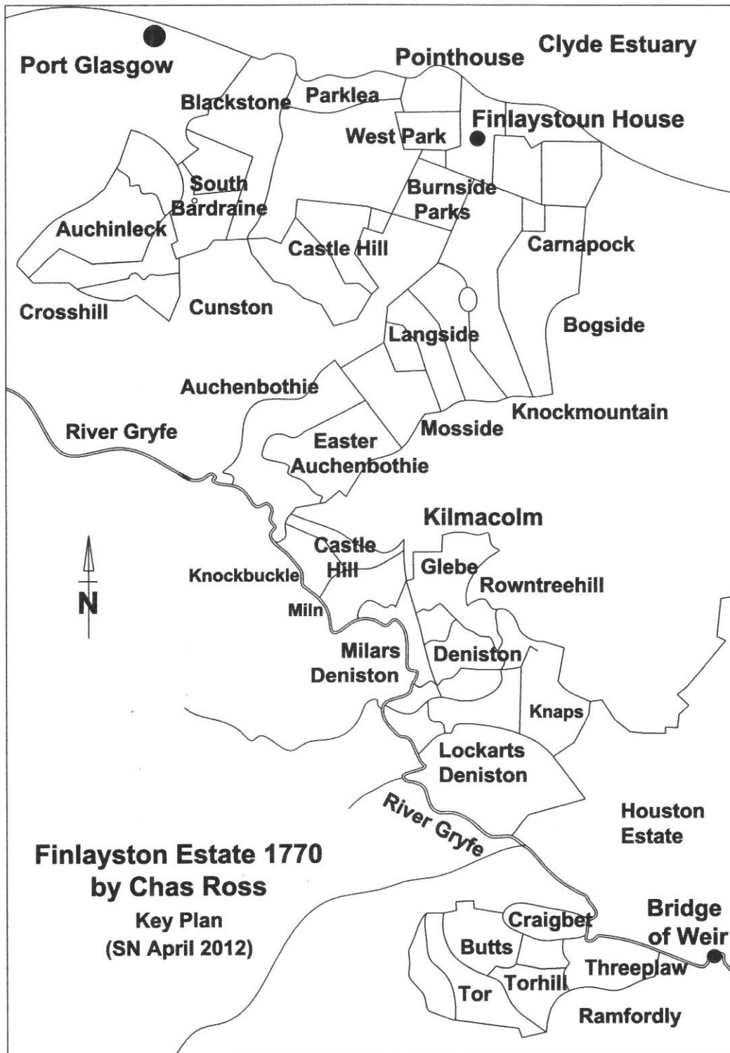
Figure 25: Key Plan of Finlayston Surveys (1770)