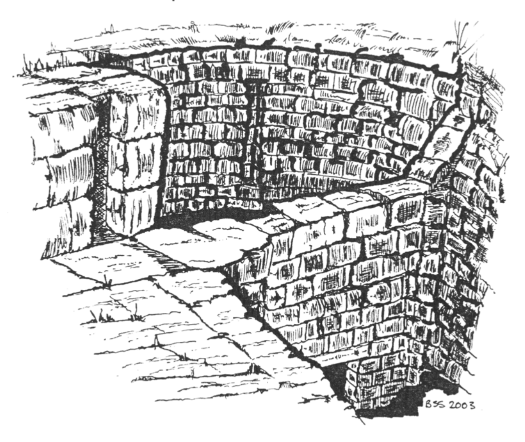
Figure 9: View of Corseford Shaft from West