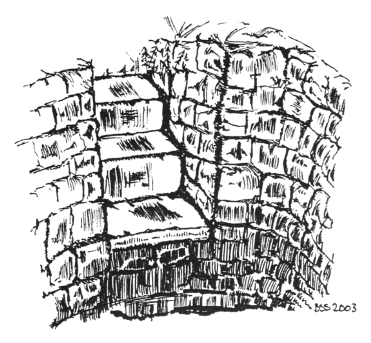
Figure 8: Detail of Steps at North End of Shaft