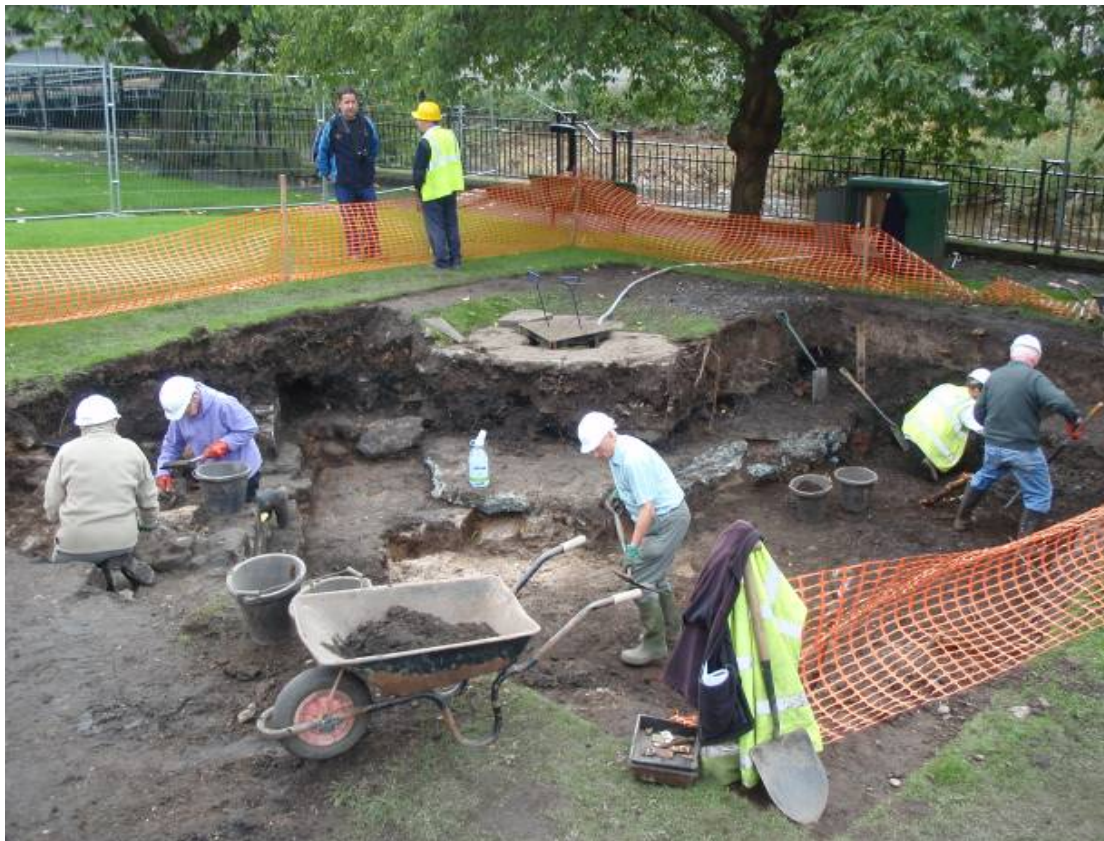
Figure 16: Volunteers in Action at Abbey Drain dig

A trench 8m by 6m was excavated around the manhole that presently provides access to the drain. After the turf was removed excavation was initially by machine to remove the upper layers of modern overburden consisting of demolition layers relating to nineteenth century tenements that occupied the site and recent landscaping. Once these were removed excavation continued by hand and revealed areas of undisturbed archaeological deposits especially in the deeper sections of the trench. The remains of a masonry wall and stone foundation were uncovered to the north-west of the trench that appear to be contemporary with the drain and could therefore be part of the monastic precinct. Part of the roof and north exterior wall of the drain were also exposed: two distinct sections of stonework suggest that the drain may have been built in two phases or was possibly repaired. Previous investigations on the architecture of the drain itself had demonstrated different phases of building.