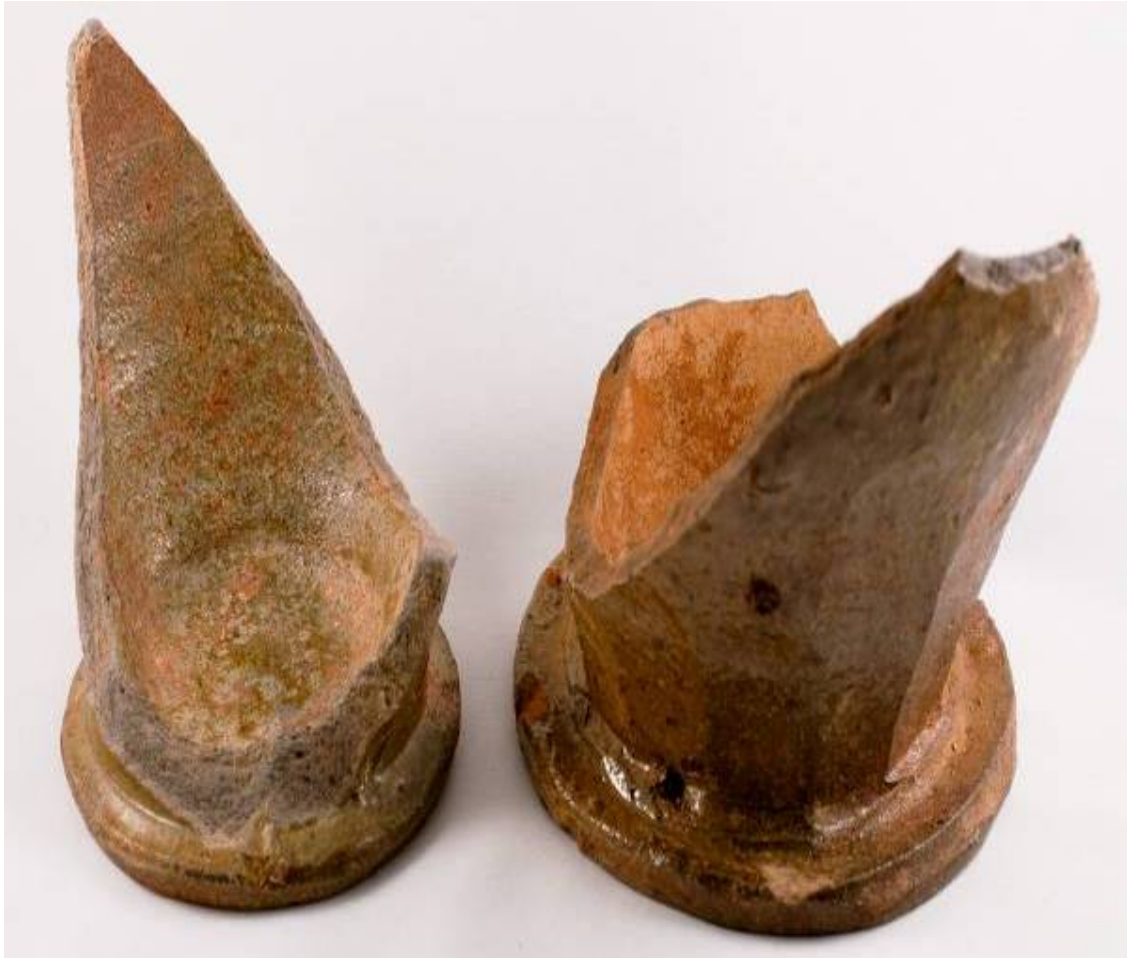
Figure 17: Bases of small jugs or vases (Bob Will, GUARD)

The material was catalogued by fabric and three main types were identified according to recognised fabric groups, Scottish Medieval Redwares, the Scottish White Gritty Ware tradition of whitewares and the late medieval/post-medieval greyware tradition (Scottish Post-medieval reduced wares and Scottish Post-medieval oxidised wares). All the sherds were counted and weighed along with identifiable features (rims, bases, handles etc) and types of decoration were entered into the database. Where possible the type or shape of the vessel was also recorded.