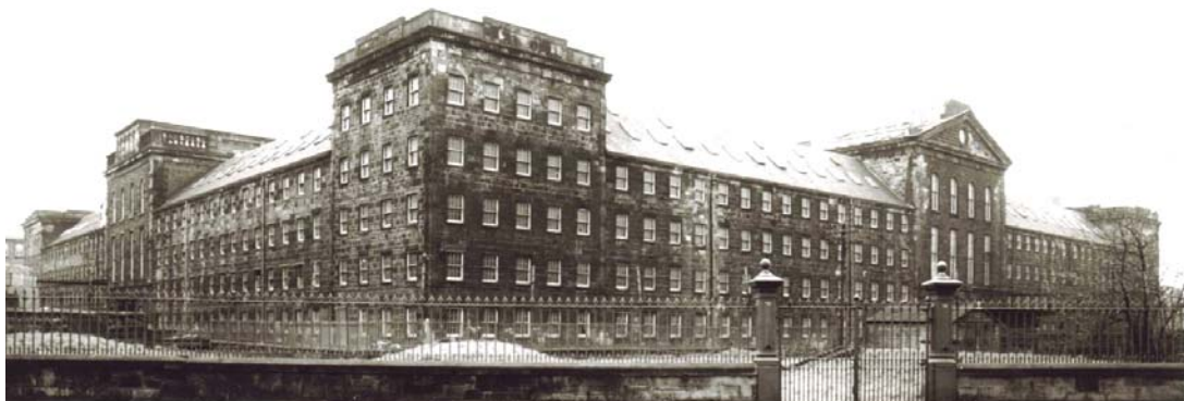
Ferguslie Mills c.1850s