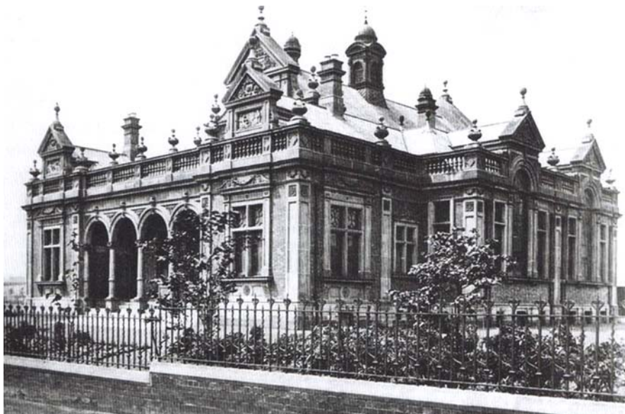
The Half Timers School