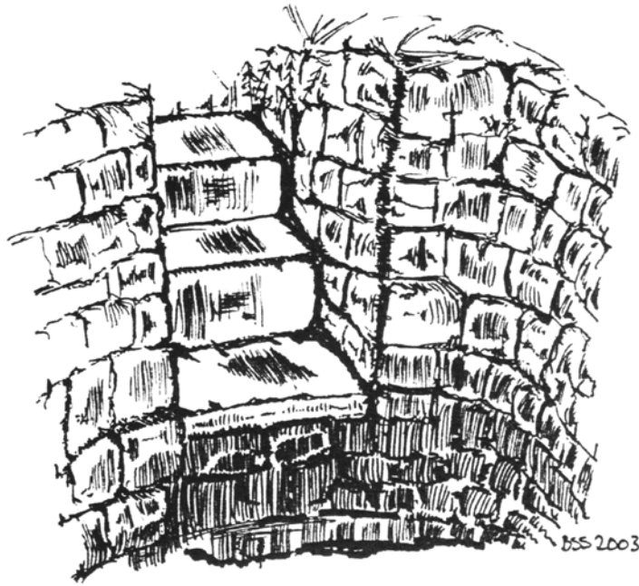
Figure 8: Detail of Steps at North End of Shaft